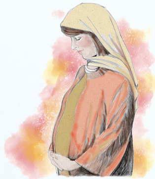
Answer: B (See Luke 1:5, 39-41.)