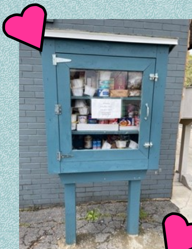
The Blessing Box at MoCo