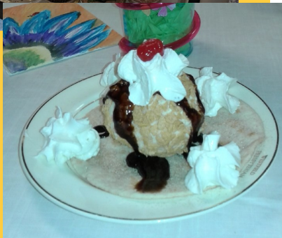
Delicious Desserts at JOY