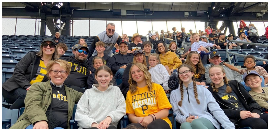
YO! families and friends at Faith Night at PNC Park on May 20

It's an exciting time to be a part of YO! We have new kids joining us for the summer. If you haven't participated in a while, it's a great time to jump in. Come to Sunday School. Come to our weekly meeting on Thursday. Definitely come to one of our summer events.